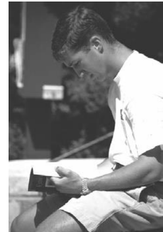
CPR & First